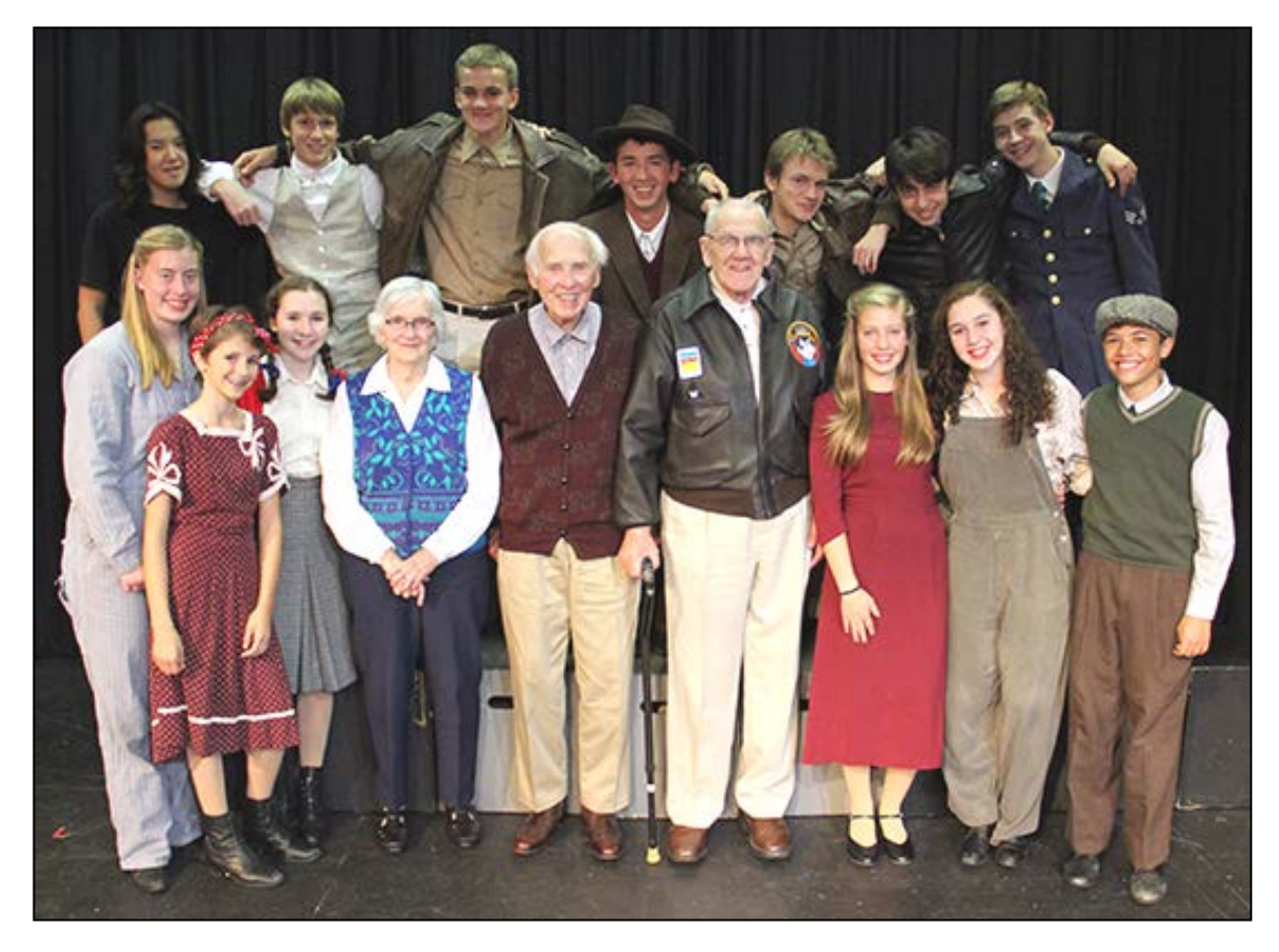
"Crates of Thunder"